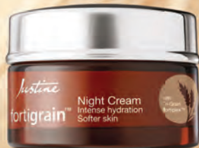
FortiGrain® Night Cream 50 ml 54101 R319