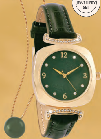
Demi Watch Gift Set Set features an 18ct gold necklace with faux-pearl pendant and a watch with black mock-croc strap, green dial and gold-toned case. Necklace: 40.5 cm + 9 cm extender Pendant: 1.2 cm Face: 3.2 cm x 4.4 cm Watch length: 24.2 cm 1588802 R369