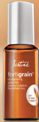
FortiGrain® Revitalising Solution 30 ml 54199 R299

Powered by the nourishing Tri-Grain Fortiplex®, a complex of botanical grains and vitamins, this revitalising regime helps restore strength, comfort and healthy-looking skin.