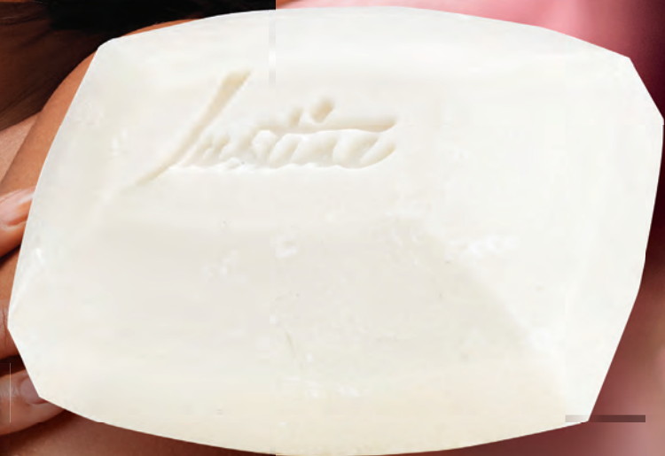
Tissue Oil Facial Cleansing Bar 150 g 07435 R139

All cosmetic product results are achieved and maintained with continued use.