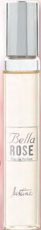
Bella Rose Eau de Parfum 10 ml 1518682 Regular Price R119