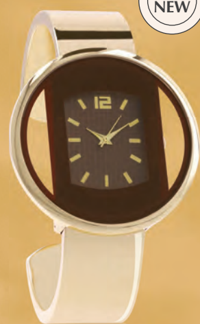
Kara Watch Gold-toned cuff bangle watch with brown dial and gold numbers. Face: 4 cm diameter Cuff internal dimensions: 6 cm x 4.4 cm 1588254 R369