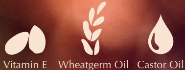
Vitamin E Wheatgerm Oil Castor Oil

A gentle facial cleansing bar that contains a unique blend of vitamin E and delicate naturally derived oils, including sweet almond oil, which leaves skin feeling soft and supple.