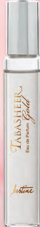
Tabasheer Gold Eau de Parfum 10 ml 07796 Regular Price R139