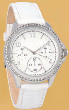
Mari Watch White genuine leather watch with mock-croc strap detail and diamanté bezel. Face: 3.8 cm diameter Watch length: 24.1 cm 1588799 R349