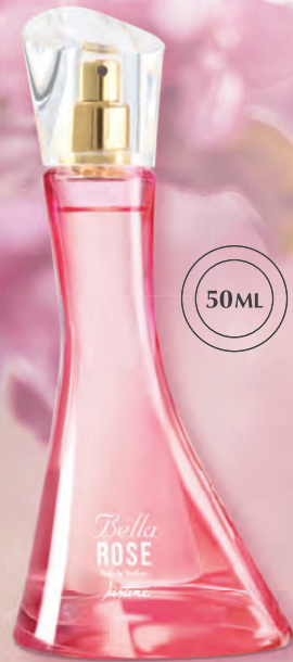
Bella Rose Eau de Parfum 50 ml 1521086 R369

A smooth, elegant fragrance that blooms with gentle florals and settles into a soft, warm finish that lingers close to the skin.