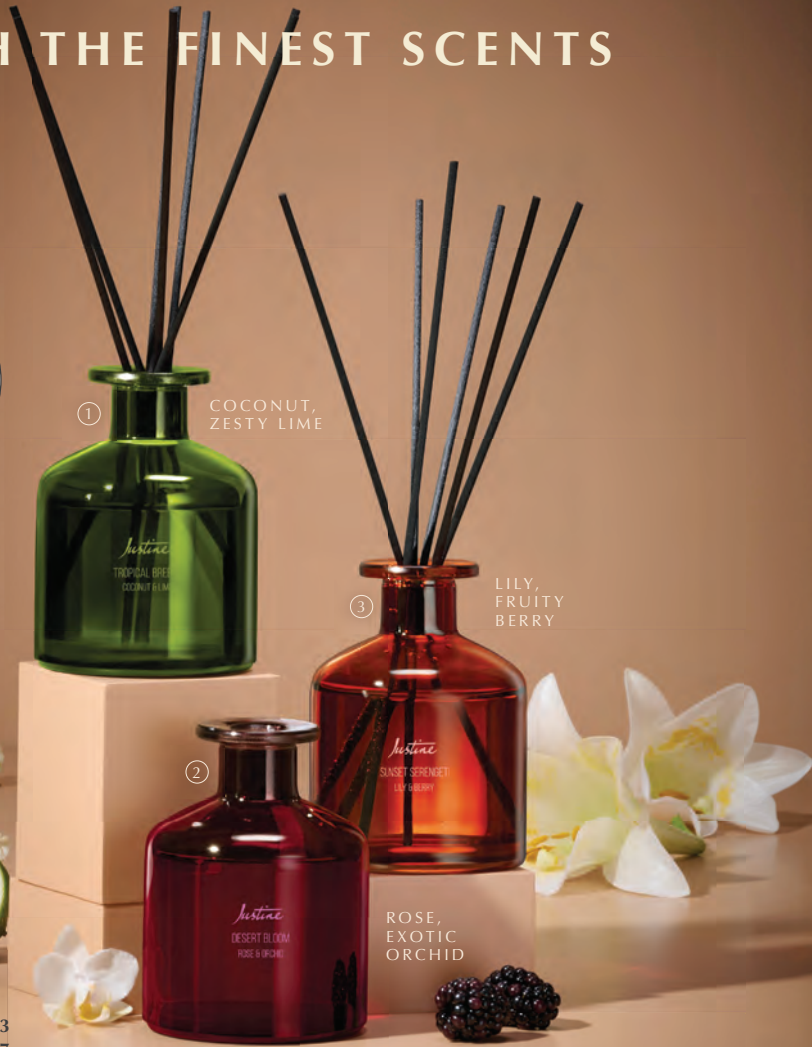
1 COCONUT, ZESTY LIME