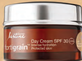
FortiGrain® Day Cream SPF 30 50 ml 53220 R319