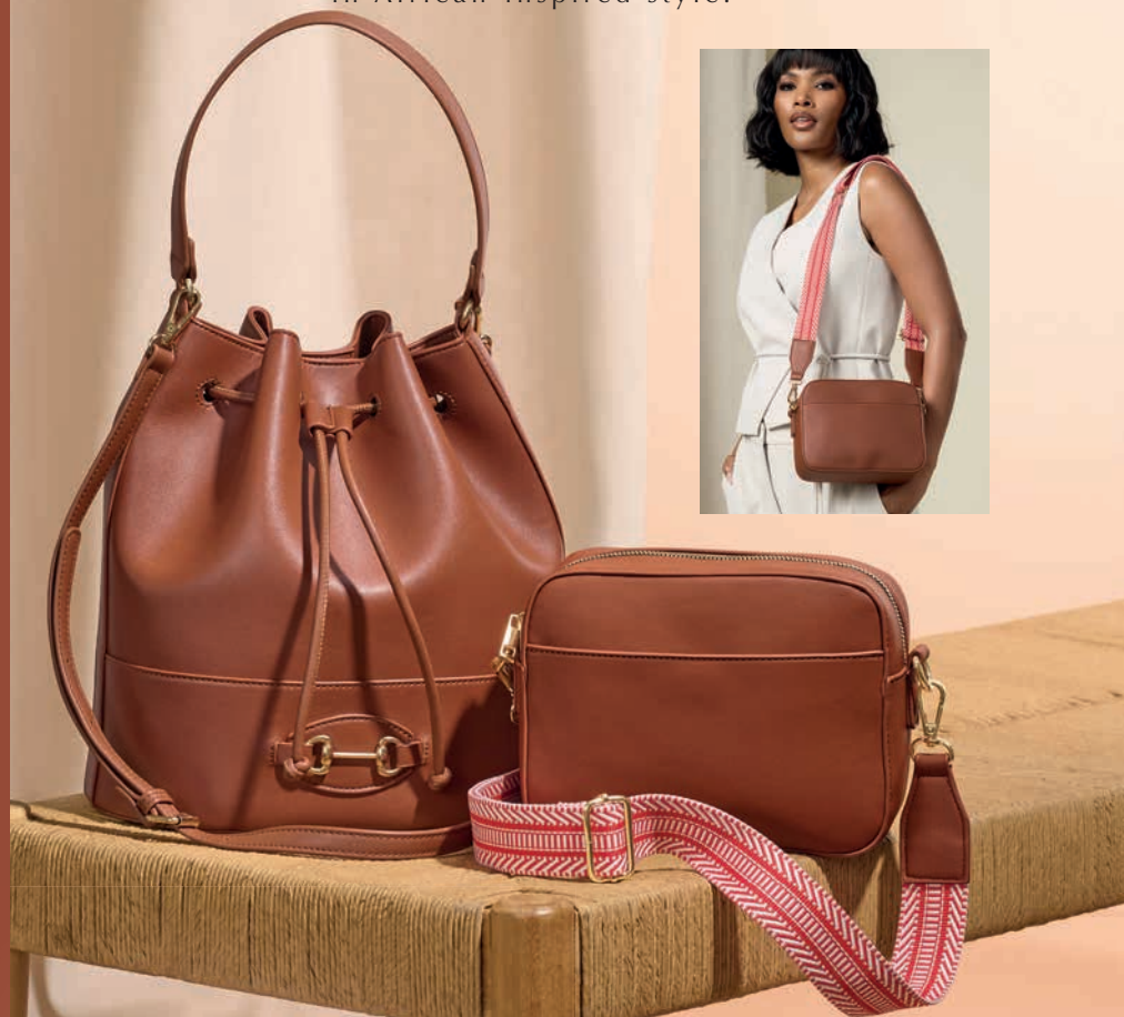
Dakaria Bucket Bag Brown faux-leather bucket bag with drawstring closure, grab handle & removable shoulder strap. 26 cm L x 17 cm W x 29 cm H 1579897 R499 90

Now you can complete your collection of this staple to see you through the year, & beyond, in African-inspired style.