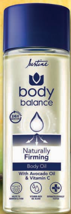
Body Balance Naturally Firming Body Oil 200 ml 1542617 R169 90

ENRICHED WITH VITAMIN E & CLINICALLY SHOWN TO INCREASE SKIN SMOOTHNESS IN 14 DAYS*