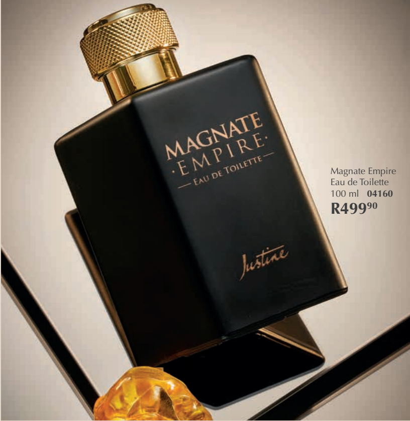
Magnate Empire Eau de Toilette 100 ml 04160 R499 90

Ambition translates into action with the heart notes of exotic spices & passionate cinnamon that wind down into distinguished sandalwood, amber, vanilla & musk.