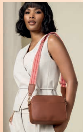
Dakaria Crossbody Bag Brown faux-leather sling bag with adjustable red & cream woven shoulder strap. 20 cm L x 7 cm W x 15 cm H 1580099 R379 90 ALL LIMITED EDITION