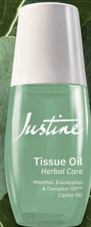
Tissue Oil Herbal Care 100 ml 1558166 R159 90