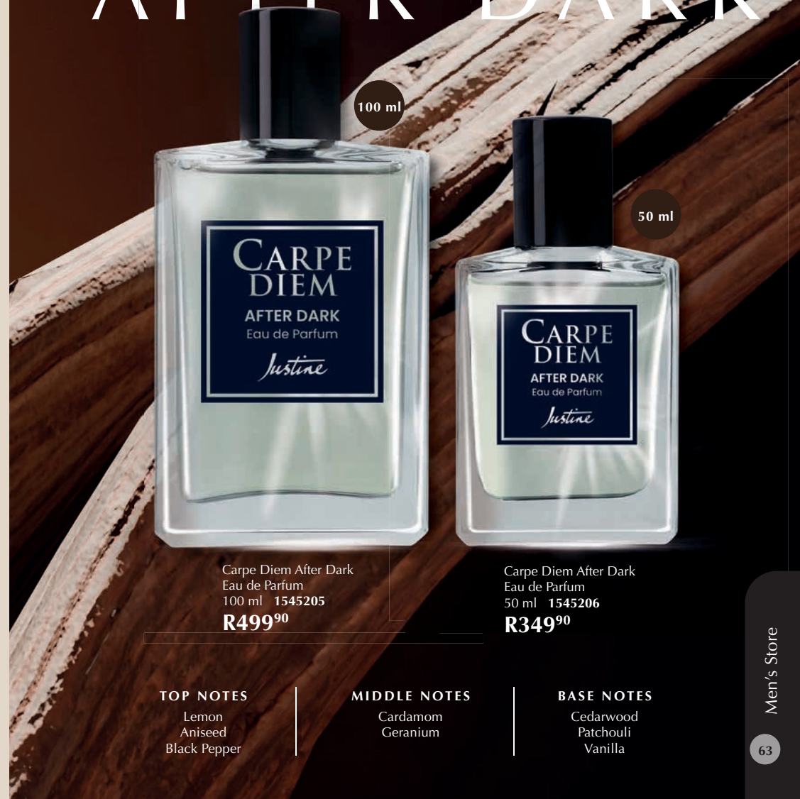
Carpe Diem After Dark Eau de Parfum 100 ml 1545205 R499 90