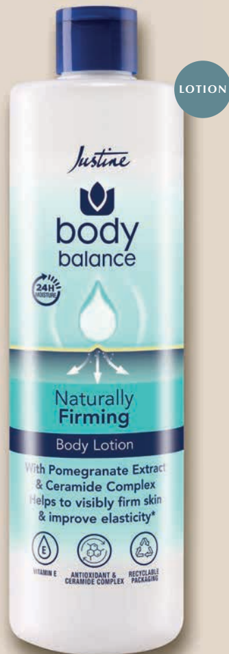
Body Balance Naturally Firming Body Lotion 400 ml 1530376 R99 90

A LIGHTWEIGHT FORMULA WITH POMEGRANATE EXTRACT THAT VISIBLY TIGHTENS SKIN