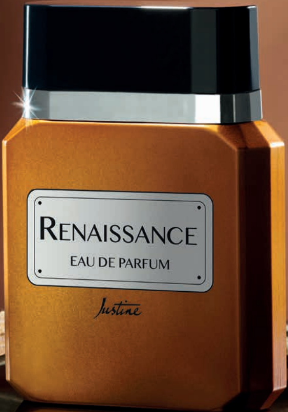
Renaissance Eau de Parfum 100 ml 1321390 R549 90

Masculine notes of patchouli, cedarwood & cashmeran create a strong base for the spicy, floral notes of orris, coffee & cardamom.