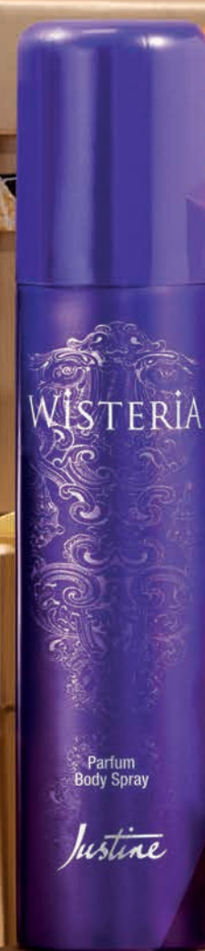
Wisteria Parfum Body Spray 100 ml 1444198 R69 90