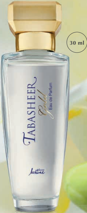
Tabasheer Gold Eau de Parfum 30 ml 1465324 R299 90