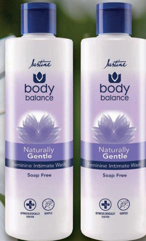
Body Balance Naturally Gentle Feminine Intimate Wash 250 ml 1535185