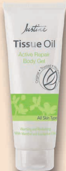
Tissue Oil Active Repair Body Gel 75 ml 1439031 R159 90