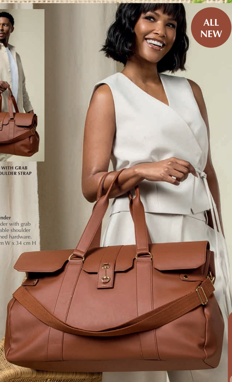
Dakaria Weekender Unisex weekender with grab handles, adjustable shoulder strap & gold-toned hardware. 53 cm L x 22 cm W x 34 cm H 1580101 R599 90