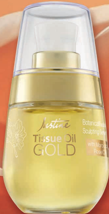
Tissue Oil Gold Botanical Facial Sculpting Serum 30 ml 1321822 R429 90

All cosmetic product results are achieved and maintained with continued use.