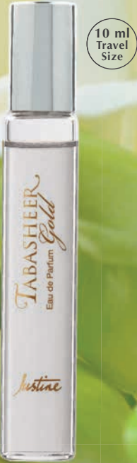
Tabasheer Gold Eau de Parfum 10 ml 07796 R139 90