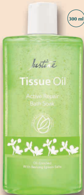
Tissue Oil Active Repair Bath Soak 300 ml 1439032 R179 90