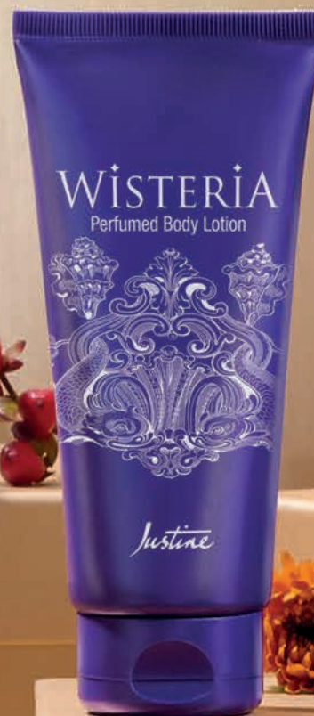
Wisteria Perfumed Body Lotion 100 ml 1522175 R79 90