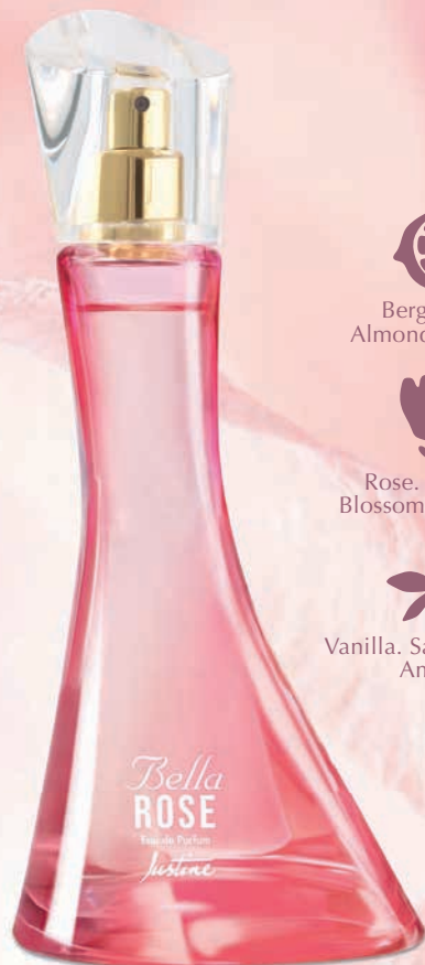
Bella Rose Eau de Parfum 50 ml 1521086 R349 90

A bouquet of soft, sensual floral notes leaves a trail of captivating elegance & an inviting aroma of rose, praline & vanilla that lingers on the skin.