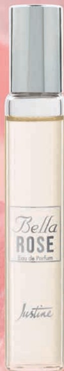
Bella Rose Eau de Parfum 10 ml 1518682 R139 90

Experience delicate notes of peach & orange blossom, blending with the timeless beauty of tuberose & melting into vanilla & sandalwood.