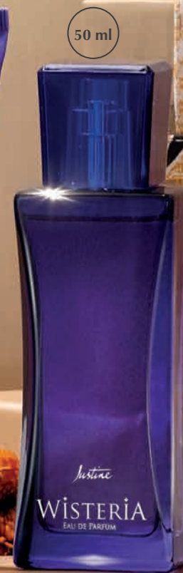
Wisteria Eau de Parfum 50 ml 1444160 R449 90