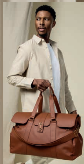
UNISEX DESIGN WITH GRAB HANDLES & SHOULDER STRAP