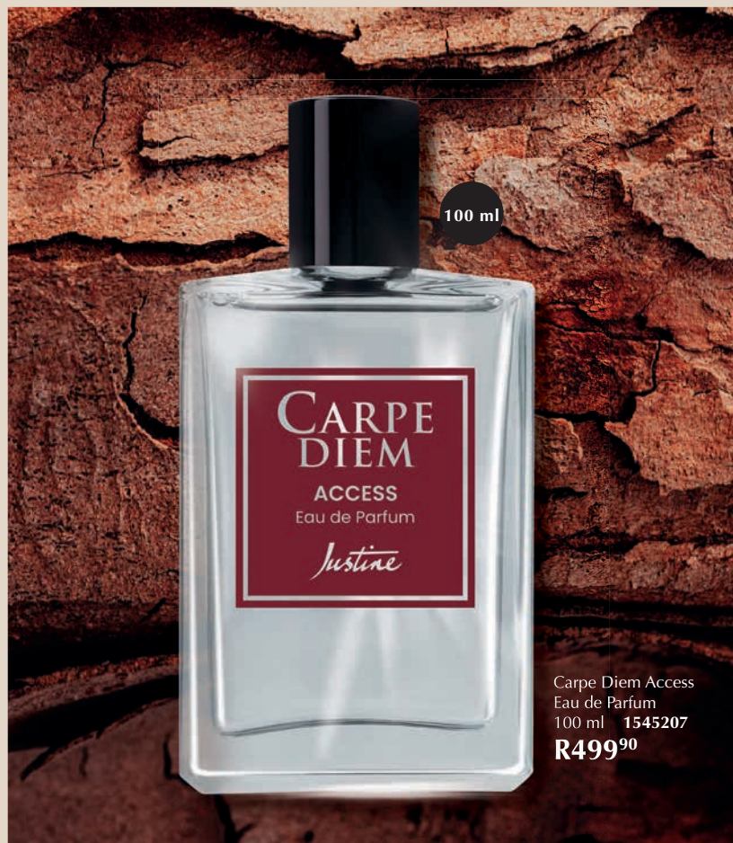
Carpe Diem Access Eau de Parfum 100 ml 1545207 R499 90

A scent for the man who commands respect, with enticing notes of nutmeg & galbanum on aromatic vetiver, amber & sandalwood.